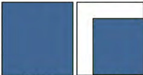
Full Page 9 3/4" w X 14" d Junior Page 7 3/4" w X 10 1/2" d